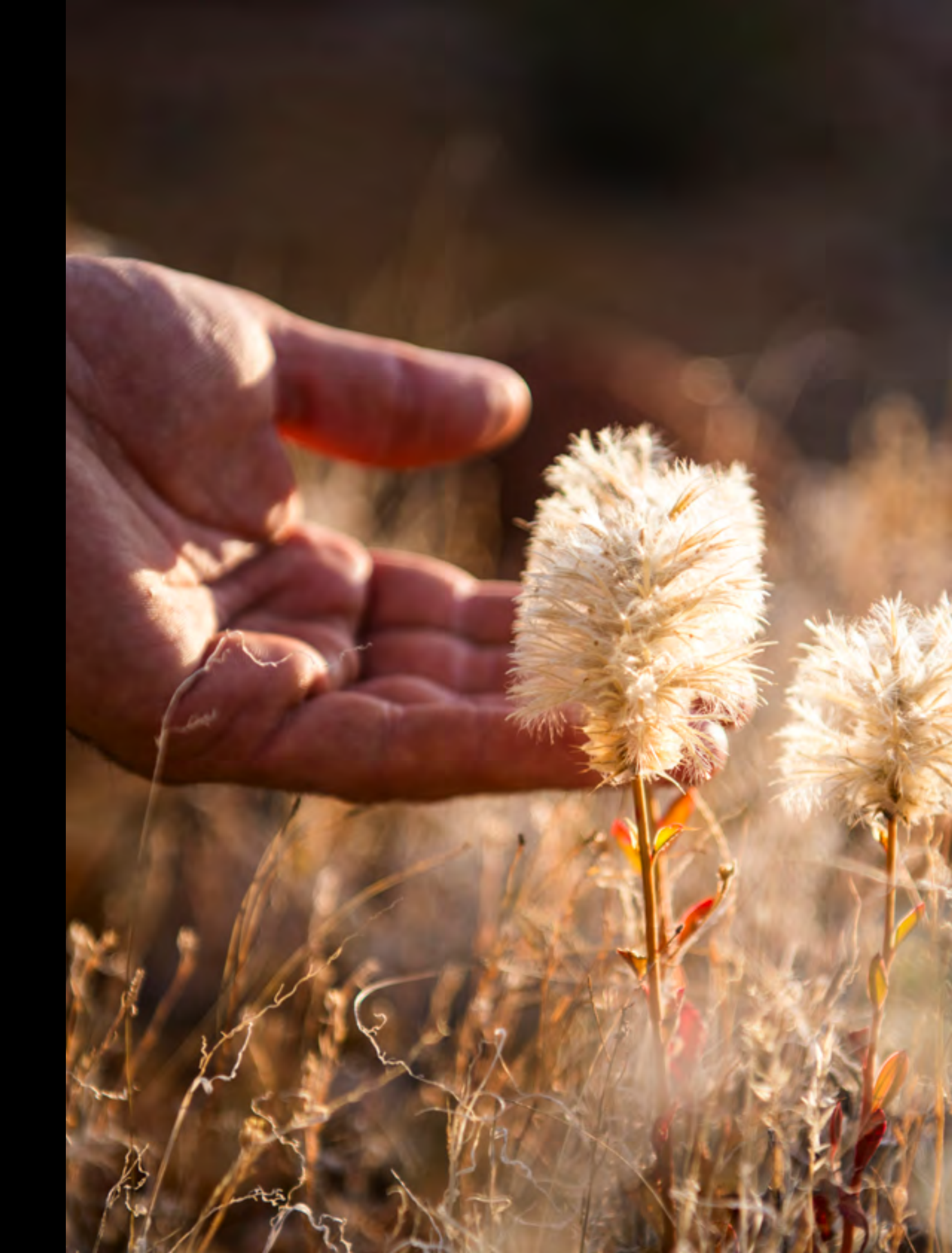
Bush Heritage Australia is a charity supported by the Mutual Trust Foundation in 2024.

ALICE.WALTER@MUTUALTRUST.COM.AU +61 3 9605 9500