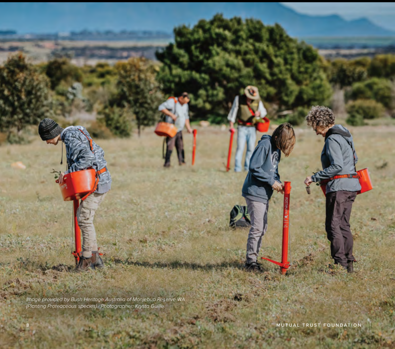
Image provided by Bush Heritage Australia of Monjebup Reserve WA (Planting Proteaceous species). Photographer: Krysta Guille.

Generous giving from Mutual Trust Foundation donors contributed to Bush Heritage Australia's vital conservation activities across Australia. Some of Bush Heritage's recent initiatives are outlined on the next page.