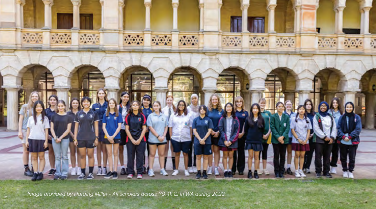
All scholars across Y9, 11, 12 in WA during 2023.